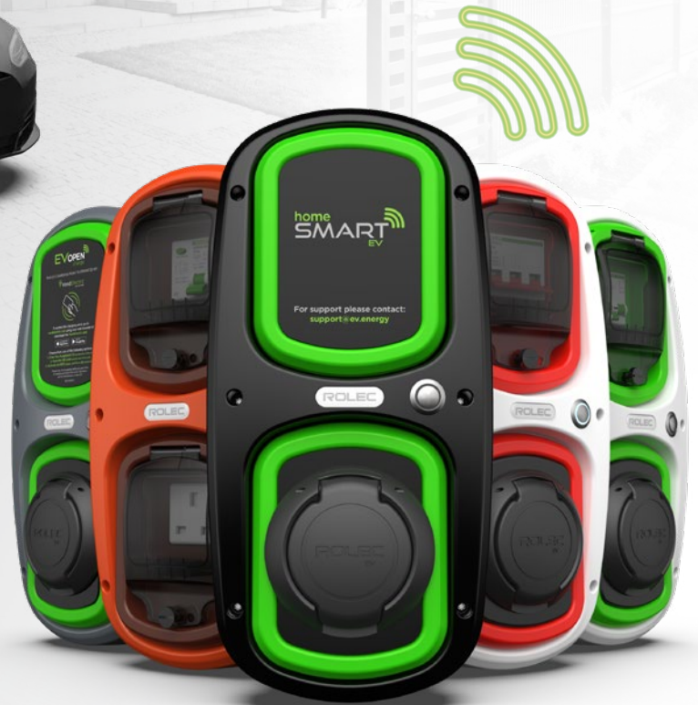
WALLPOD:EV OPEN CHARGE Socket (Type 2) Charging Unit

Compatible with all EVs/PHEVs, the WALLPOD:EV is available in Mode 2 2kW charging speed or Mode 3 fast charging in both 3.6kW and 7.2kW, as well as SuperFast 11kW and 22kW speeds.